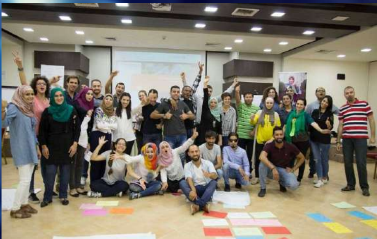
FACILITATION OF THE PLANNING WORKSHOP FOR OPT YOUTH STRATEGY (OXFAM).

04 RETREATS FOR LOCAL AND INTERNATIONAL ORGANIZATIONS